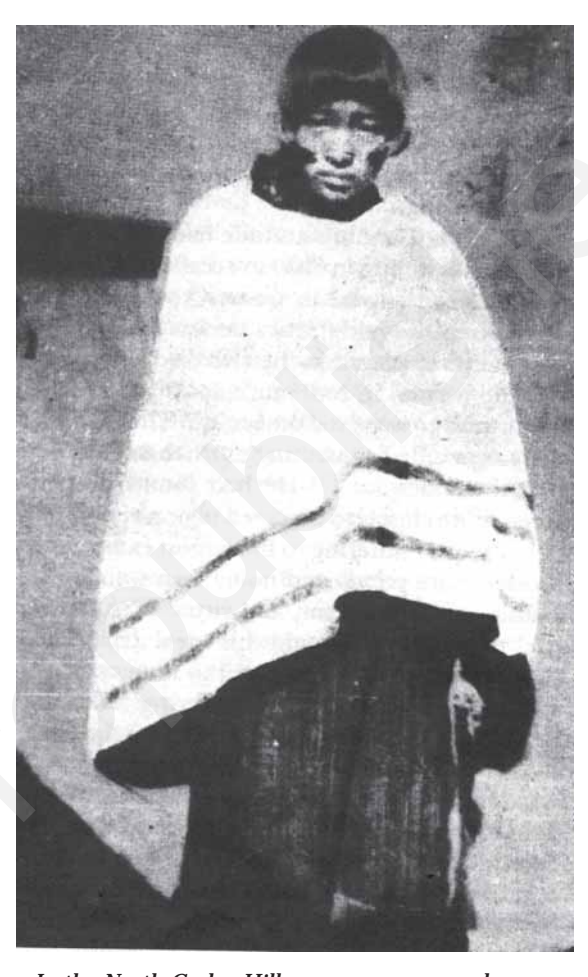
In the North Cedar Hills, a woman named Gufiallo became famous for her part in the Civil Disobedience Movement.

It can be argued that this period of activity did not constitute a social movement. It can be argued otherwise too. Let us recall some of the features that characterise social movements. It did have organisations, ideology, leadership, a shared understanding and the aim of bringing about changes on a public issue. What they succeeded together was to create an atmosphere where the women's question could not be ignored.