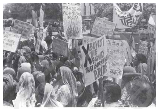
Struggle against Dowry

Apart from organisational changes, there were new issues that were focussed upon. For instance, violence against women. Over the years there have been numerous campaigns that have been taken up. You may have noticed that application for school forms have both father's and mother's names. This was not always true. Likewise important legal changes have taken place thanks to the campaign by the women's movement. Issues of land rights, employment have been fought alongside rights against sexual harassment and dowry.