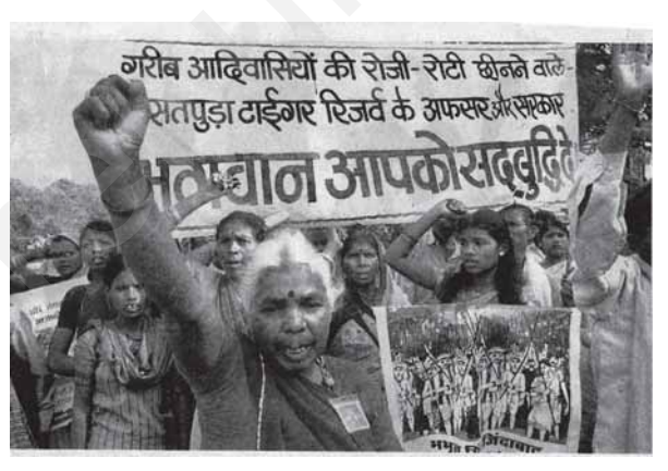
Struggles of the Tribals continue

Different tribal groups spread across the country may share common issues. But the distinctions between them are equally significant. Many of the tribal movements have been largely located in the so called 'tribal belt' in middle India, such as the Santhals, Hos, Oraons, Mundas in Chota Nagpur and the Santhal Parganas. The region constitutes the main part of what has come to be called Jharkhand. We will not be able to go into any detailed account of the different movements. We take Jharkhand as an example of a tribal movement with a history that goes back a hundred years. We also briefly touch on