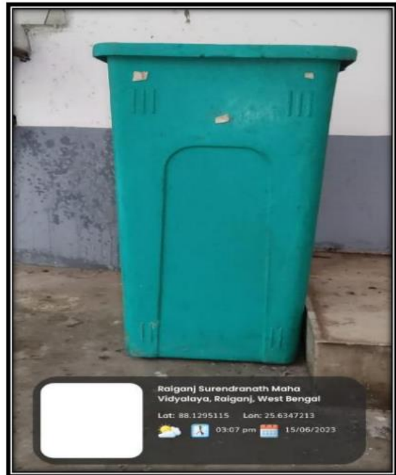
Separate bins for biodegradable and non-biodegradable waste