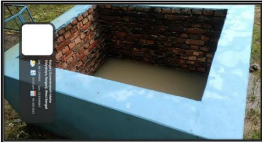
Rain water harvesting (rain water collecting tank)