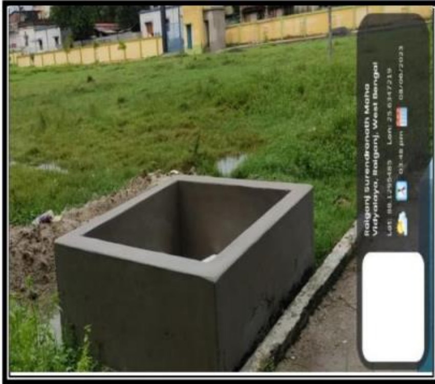
Pit for bio-composting