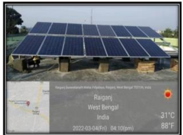
Solar Panels are being installed on Roof-top using funds from RUSA 2.0 Scheme

Chandan K Principal Raiganj Surendranath Mahavidyalaya Raiganj, U/D